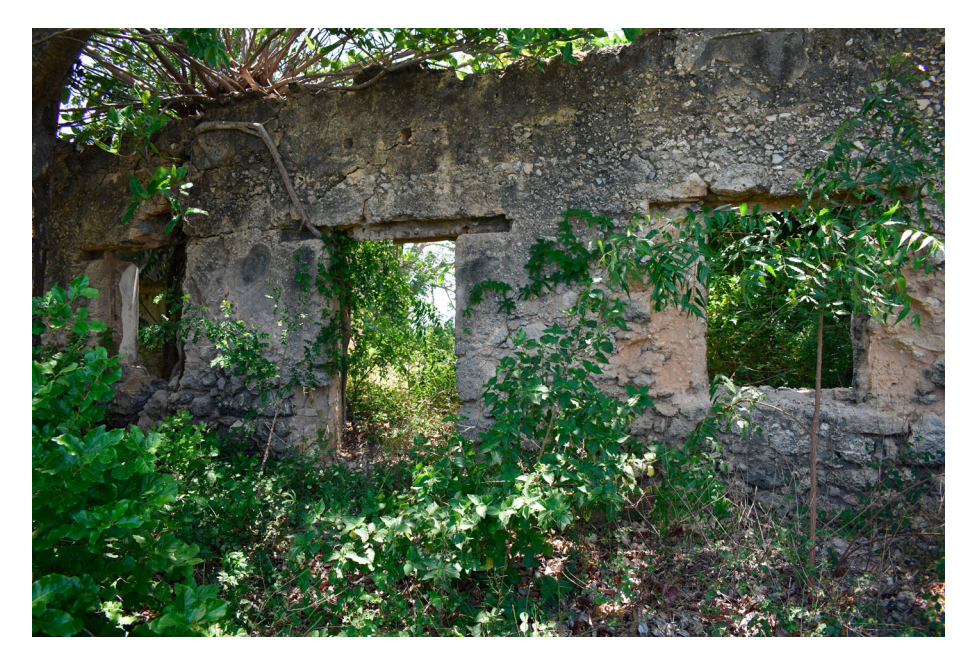
Figure 3. Front facade of ruined stone house at CP-2.

to better date the ruins and surrounding areas. After eight weeks, excavations uncovered a sequence of extensive, but shallow, deposits of archaeological material. The area excavated at CP-2 represents a very small portion of the precolonial and subsequent colonial period occupations of Cabaceira Pequena. Included in the material recorded at the site were locally made and imported ceramics, glass beads, nails, shells, and large quantities of coral stone debris and residue, likely used to make cal-lime plaster. Although we have yet to excavate the area inside the house, I think it is safe to assume that based on the architectural style of the coral stone structure and the material excavated around CP-2, the occupation of the site is contemporaneous with, if not earlier than, the original construction of the edifice.