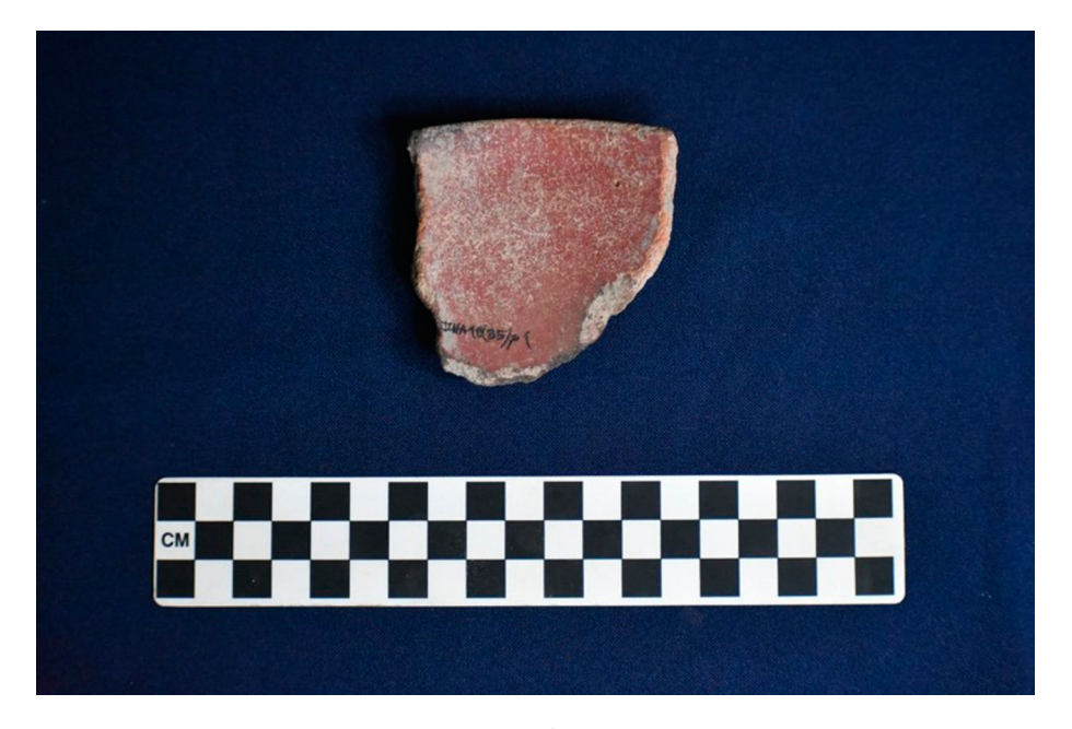
Figure 5. Red-painted open bowl, characteristic of Sancul-style, or sometimes called Swahili-ware.

in 1498, the major populations centres were on the continent (Disney 2009; Greenlee, Velho, and da Costa 1942). Now, the archaeological evidence suggests that the world de Gama encountered was teeming with activity and long-distance, foreign trade — both by land and sea. Once more, the excavations as CP-2 from this field work indicate that the inhabitants of Cabaceira Pequena were participating in what scholars have recently theorised as a Swahili maritime society (see Fleisher et al. 2015).