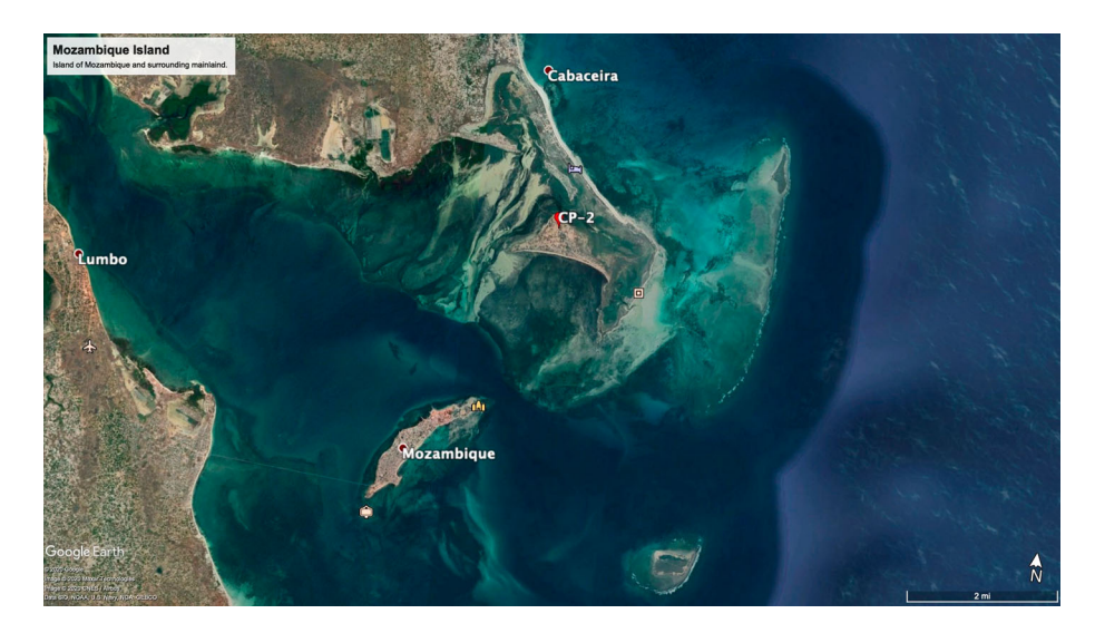
Figure 2. Map of Mozambique Island and Cabaceira Pequena. CP-2 is located to the north of Mozambique Island.

Archaeological evidence recorded from these recent projects have found locally produced ceramic styles definitively linking the mainland to the island.